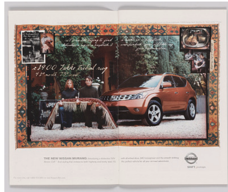
Playbill for Ma Rainey's Black Bottom on Broadway Transcribed and Reviewed by Digital Volunteers Extracted Apr-23-2024 06:46:54

For more info, call 1-800-713-3181 or visit NissanUSA.com.