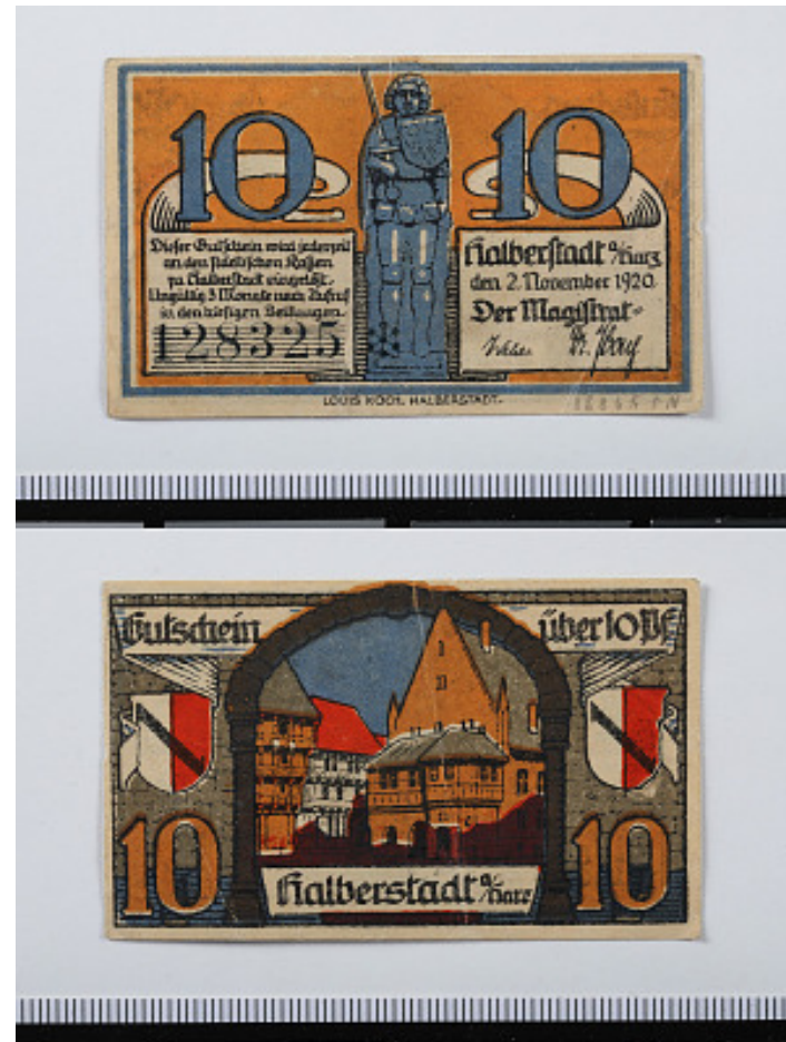
National Numismatic Collection - German Notgeld Notes, Set 8 Transcribed and Reviewed by Digital Volunteers Approved by Smithsonian Staff Extracted Apr-16-2024 05:22:31